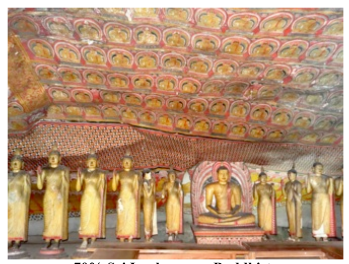
70% Sri Lankans are Buddhists

We both were surprised by our reaction to Sri Lanka. This truncated visit had revealed to us a country and a culture so different to our preconception of it.