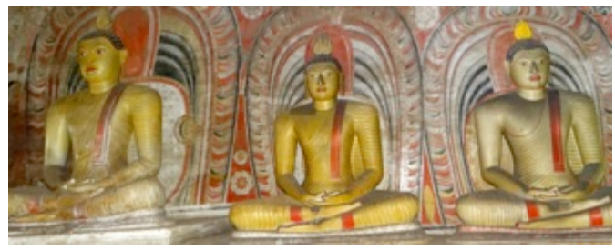
Buddha images and frescos in a Dambulla Cave

Almost as impressive as the rate of forest retention is the percentage of the wetlands one sees. Most of these are man-made wetlands with weirs and water storage for irrigation but all of the wetlands support an astonishing amount of wildlife. It appears that Sri Lanka was able to achieve so much as a nation because it developed the irrigation and water engineers so far back in history.