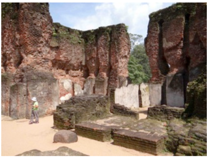
Remnant of Polonnaruva Royal Palace

We next drove across the wall of the largest area of water in all of Sri Lanka, a great reservoir built over 1500 years ago as part of an irrigation system that fed the population in and around this Royal capital at least for 250 years between about 950 AD and 1200.