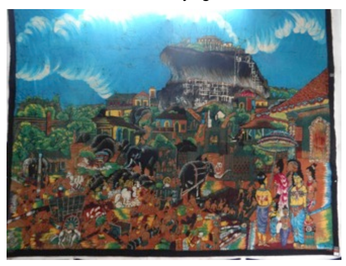
The Dambulla caves were worthy inclusions on the World Heritage List. They were hacked out of rock over a period of 1600 years and only stopped being

We were exhausted after the climb and we were happy to have a slow Sri Lankan lunch. However even then at 12.45 Sunil thought it was too hot for us to explore our next World Heritage site that again involved ascending another rock to see another World Heritage site the rock caves of Dambulla. So we killed some time going to a gem factory. I was a reluctant starter for this but I ended up coming away with something just as I later came away from the batik factory that Sunil took us to that wasn't on my agenda.