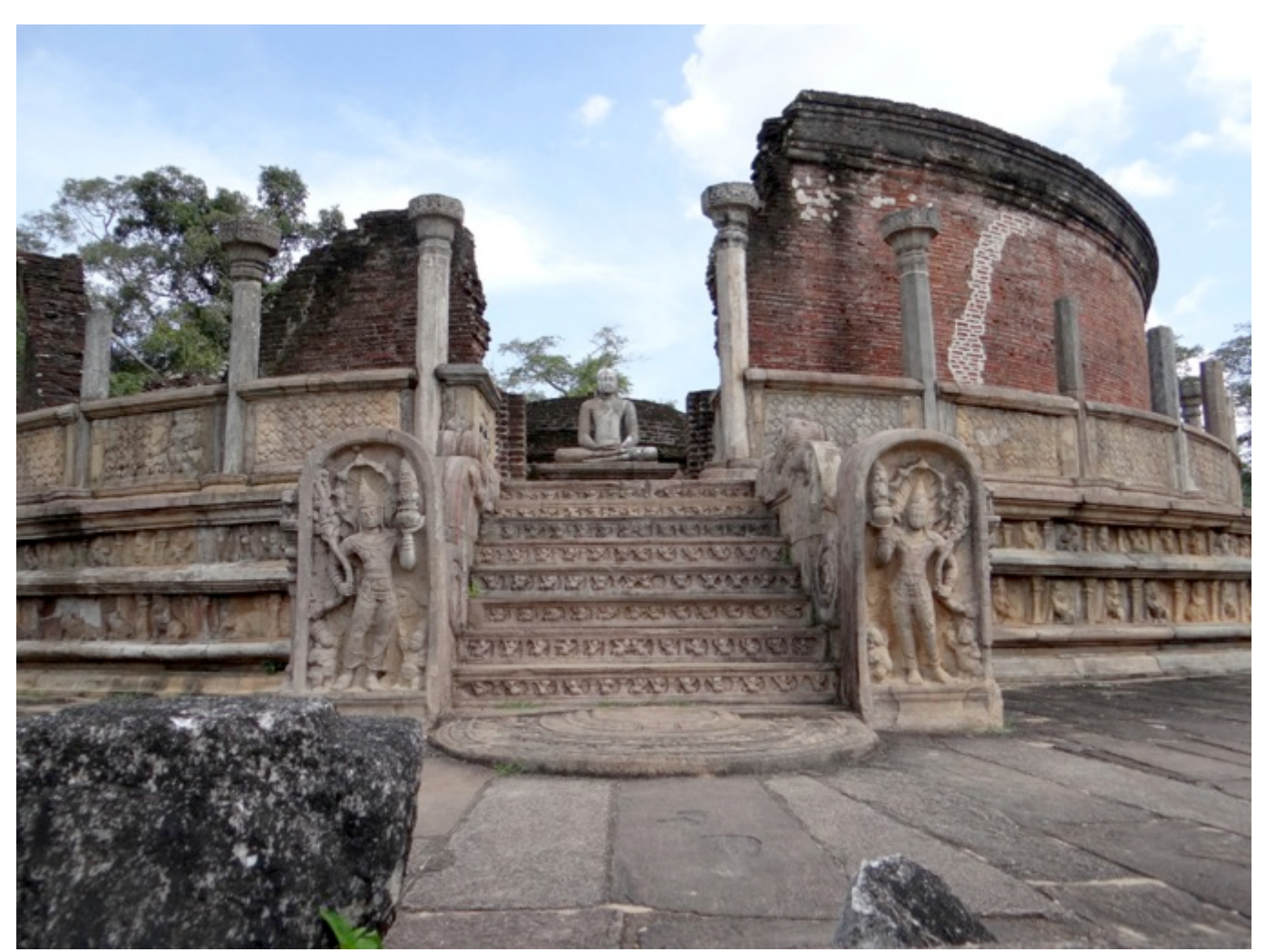
One of the many cultural heritage relics of Polonnaruva

We went to Sri Lanka to gain a better, more personal understanding of the people and cultures of this troubled country and to discover some of its World Heritage. We visited six sites all north and east of Colombo in the week we had there. We would liked to have seen more and left with a feeling that we would like to return soon.