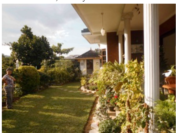
Our Kandy accommodation. Kandy Greenview Boutique

Perhaps it was the rareified air but once we were back on the flatland and good pavement with few bends but lots of traffic I had trouble staying awake. It may also have been that it was after 2.30 and I was overdue for sustenance. However we negotiated the chaotic traffic of Kandy and Sunil took us to an expensive restaurant overlooking the lake and town and once replete we went to our accommodation, a lovely retreat.