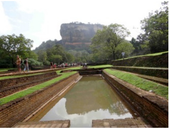
Sigiriya Rock as seen from the lower garden

After this site and topping up our fruit supplies at inflated prices we were taken to accommodation arranged by Sunil with some family connection. It was a very comfortable and very affordable B&B. Sunil celebrated by getting Su to polish off a large bottle of beer on her own and me to imbibe a fair slug of gin. They were really a knockout and we had to be wakened to have the dinner that we had ordered.